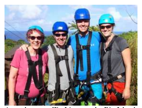
A rest between Zip Lines on the Big Island