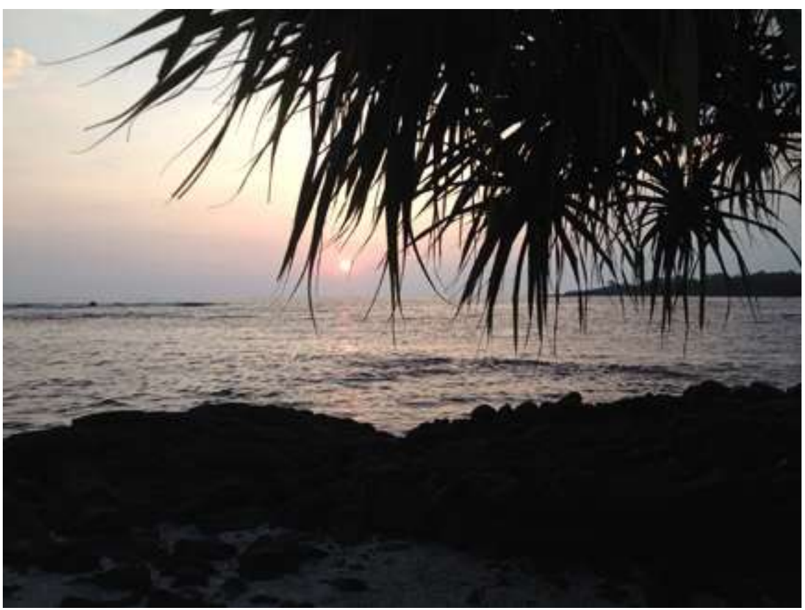
Beautiful sunset on the Big Island in Hawaii – Aloha!